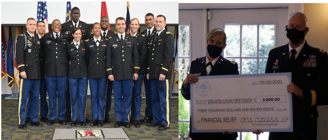
OCS Class 59