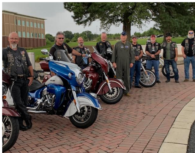
The Line Up! Before the rain came down!

We so appreciate the ongoing support and friendship from the current and previous members of the U S Military Vets Motorcycle Club that date back to 2011! THANK YOU TO ALL!