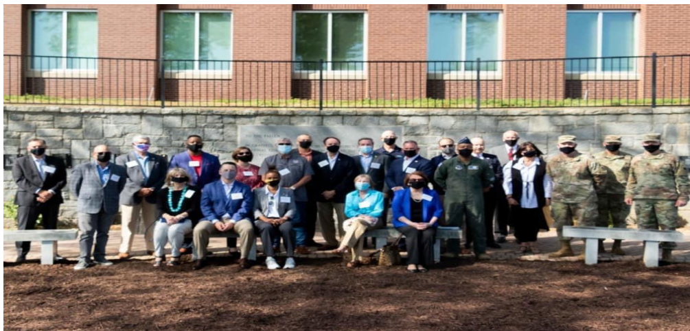
Community Engagement Event-13 April 2021