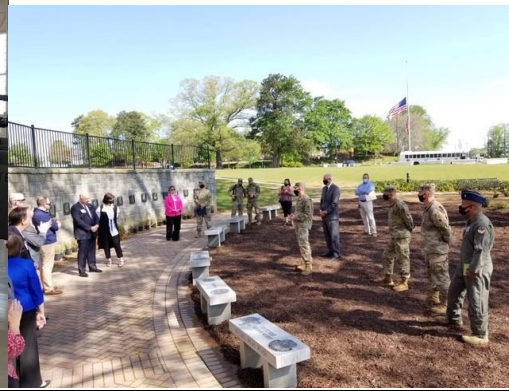
Freedom Memorial Wall Briefing