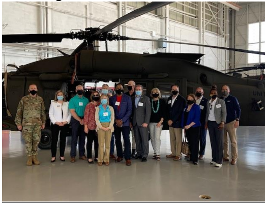
Hangar 1 Visit