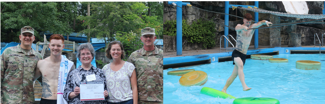
First Place Donations!