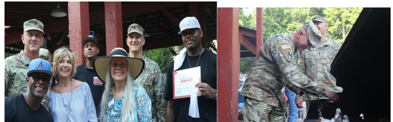
Cooking Team and MBA!